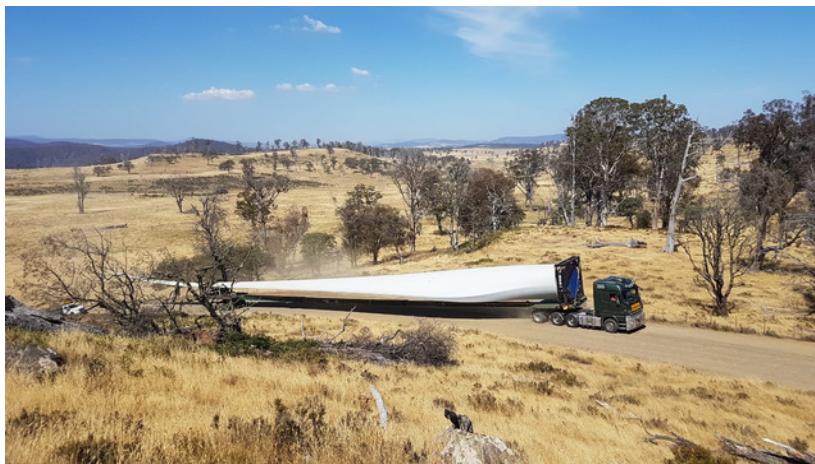
First Goldwind blade travelling to site on 1st March 2019

Capture a photo of a blade travelling between the Port of Bell Bay and the Cattle Hill Wind Farm project site, email it to us before 31st March with your contact details and you'll be in the running to win some great prizes!